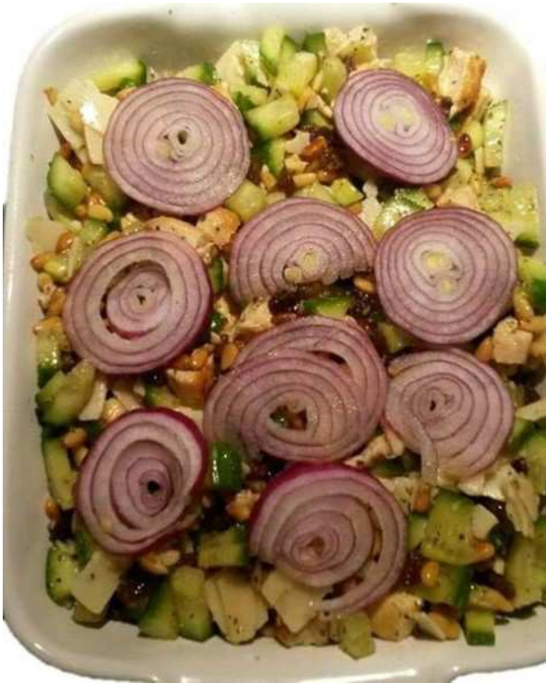
Fig. 2 – Sala Cattabia from Apicius