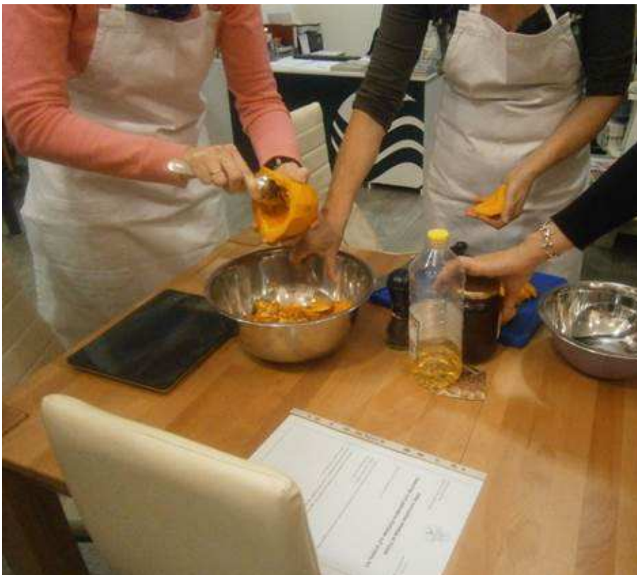
Fig. 1 – Roman cooking workshop, Klagenfurt 2015