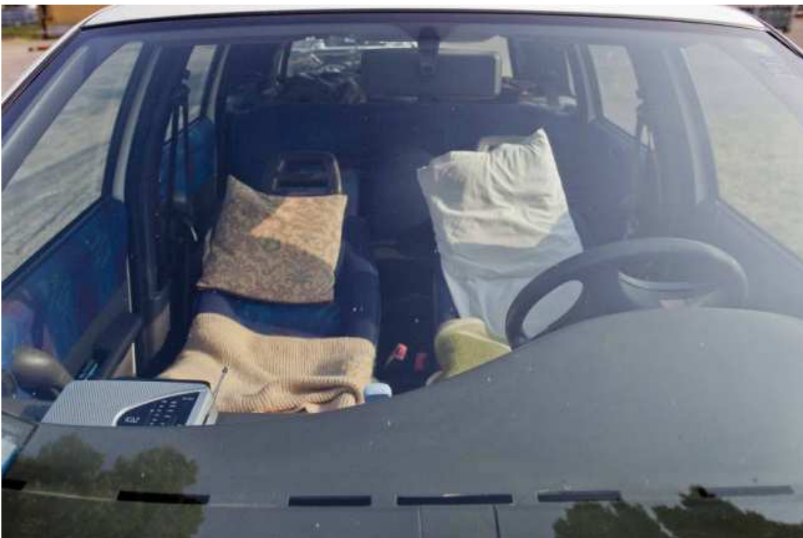
Fig. 12 – People too afraid to sleep home used cars as a bedroom.