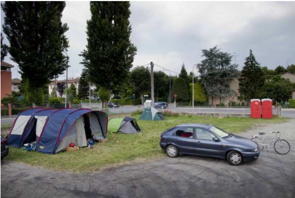
Fig. 11 – Spontaneously grown camping site.