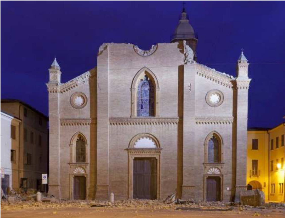
Fig. 3 – The Duomo. The ceiling is completely destroyed and the bell-tower is severely damaged. 1

Now the city center is partially accessible, but only for people who live there. Some works have been completed to secure some buildings (like the San Francesco Church facade), but mainly the old city is still desert and hoping for further intervention.