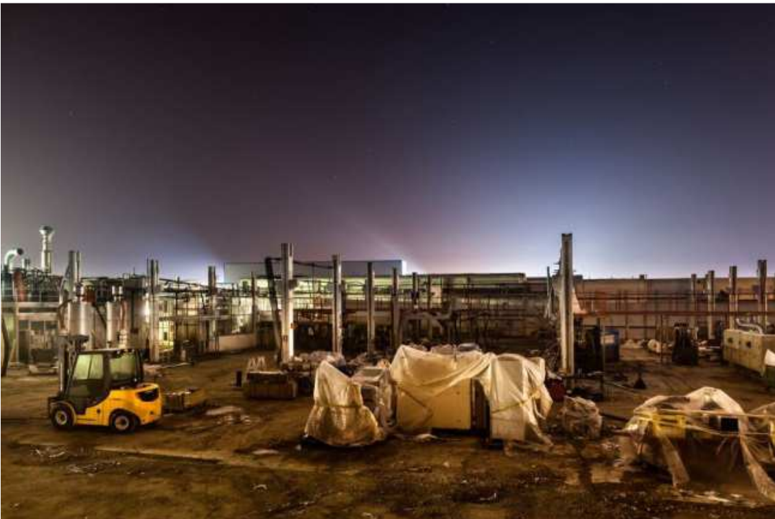
Fig. 8 – Damaged factory. The damaged ceiling has been removed.