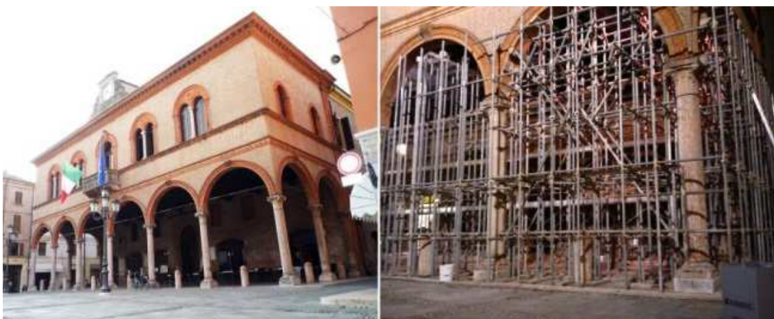
Fig. 2 – The Palazzo del Comune, before the earthquake, and after being secured with scaffolds.

Among them public buildings such as The Palazzo del Comune (a 15th century edifice of Gothic style), the castle of the Pico family, which had been recently restored and opened to the public. Both of them now damaged.