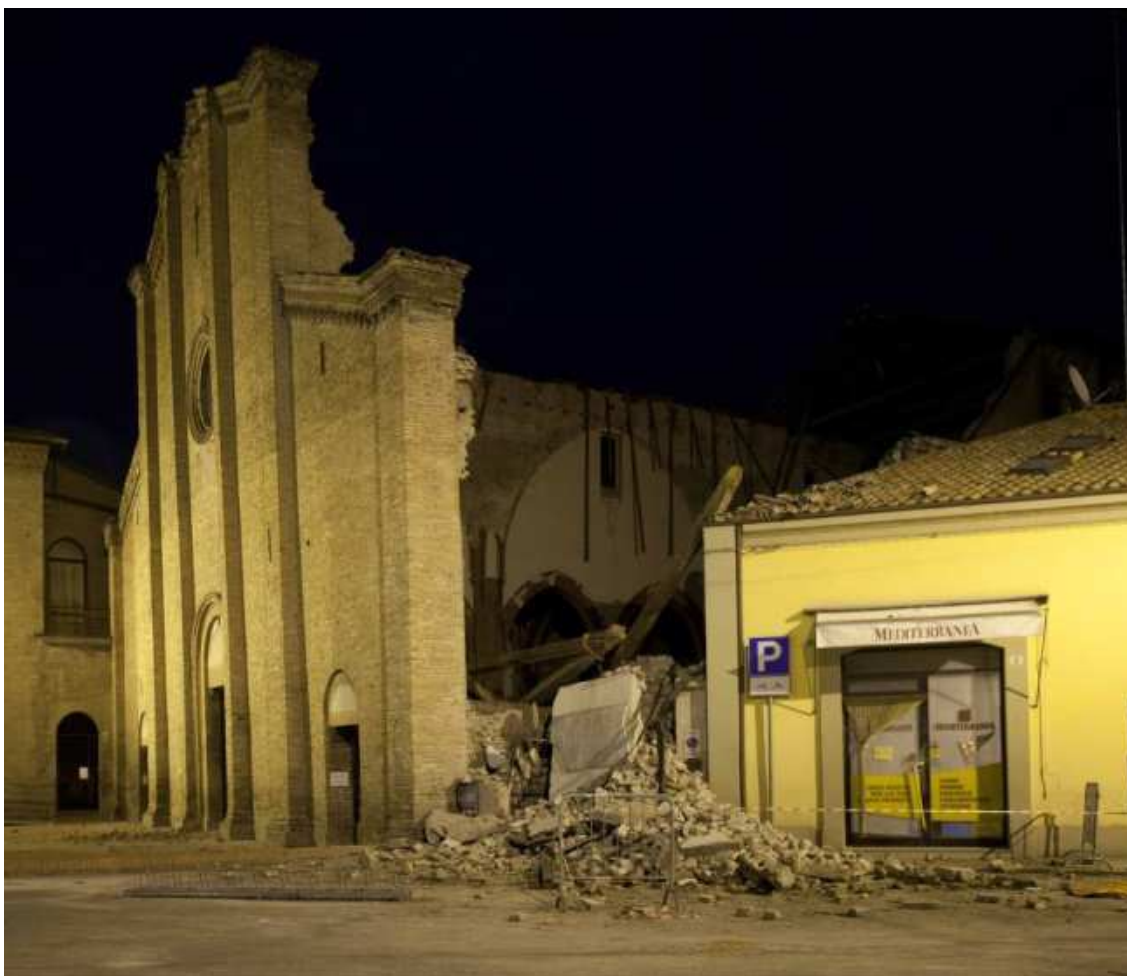
Fig. 4 – San Francesco church, the ceiling completely destroyed, the facade leaning forward.