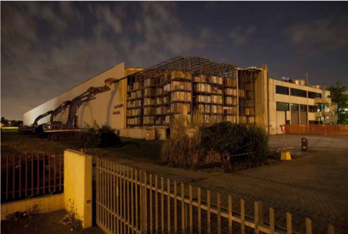
Fig. 7 – Damaged factory, with bulldozers holding the side wall in place.