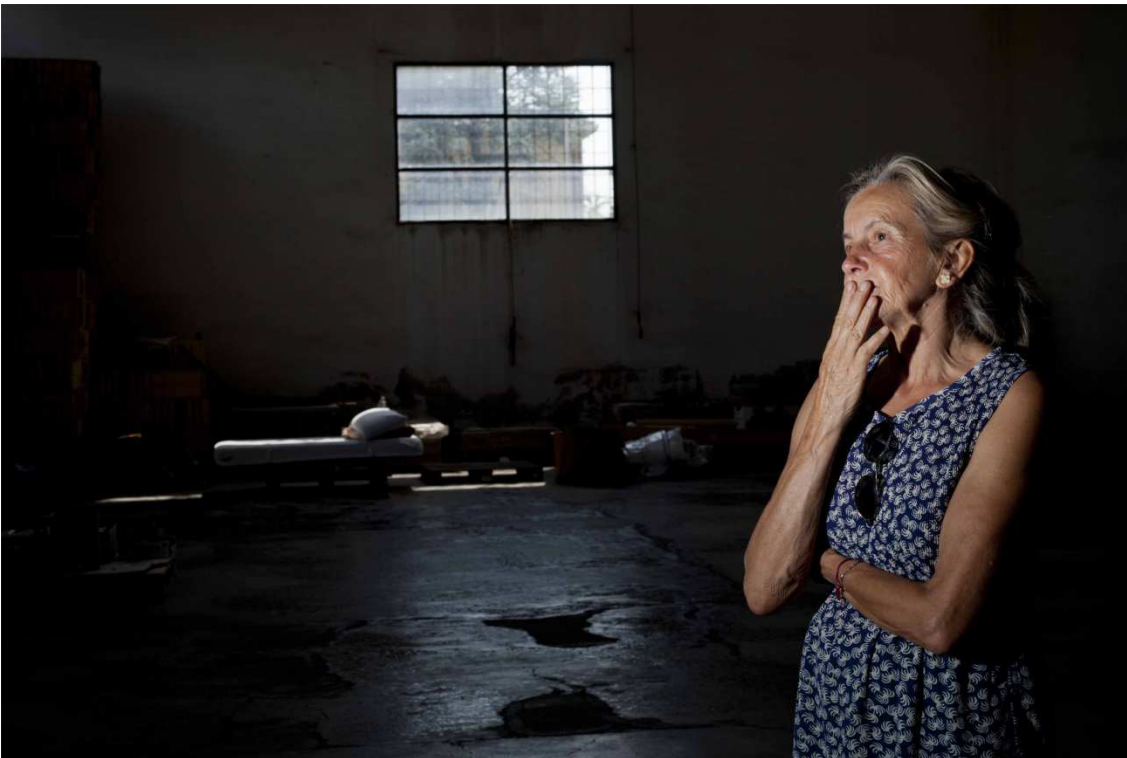
Fig. 10 – The psychological stress caused many people whose homes were intact to sleep elsewhere because of the fear of further shakes.

In this phase people naturally gathered small communities living together in public parks, camping with tents, caravans, or lightweight wooden structures. These spontaneous communities, even though very heterogeneous, managed to plan everyday life and mutual support, being open for everybody to join. Some other people decided to camp in their own gardens, in order to be next to their homes but still not willing to go back into the buildings.