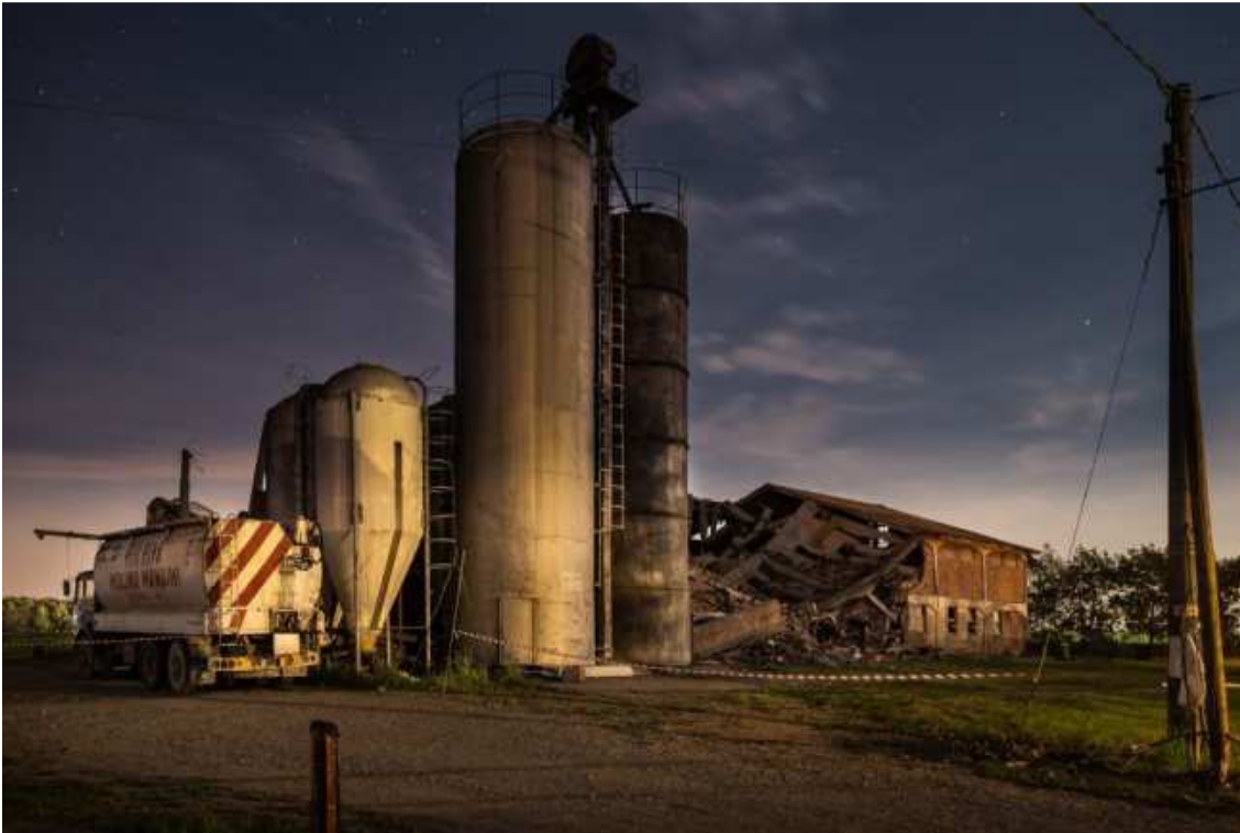
Fig. 5 – Abandoned barn and silos.

The severe damages occurred meant in many cases the end of the rural micro-economy, meaning no economic resources to restore damaged building.