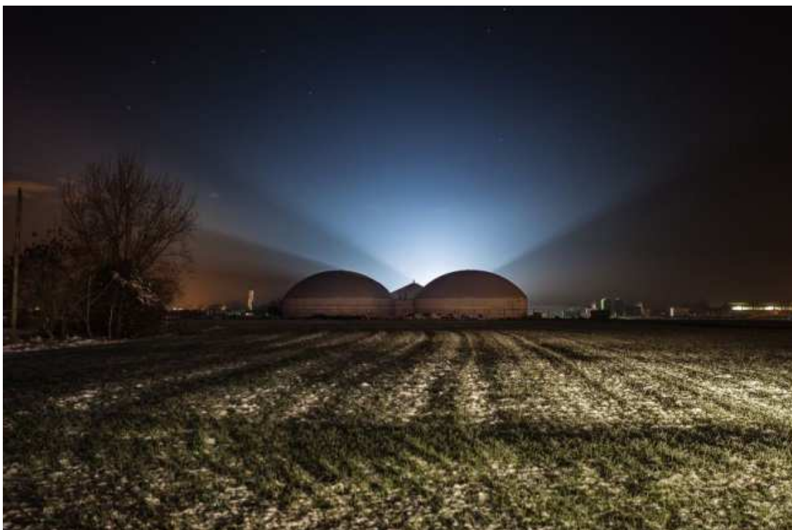
Fig. 9 – Recently built factory plant, just outside the town border.