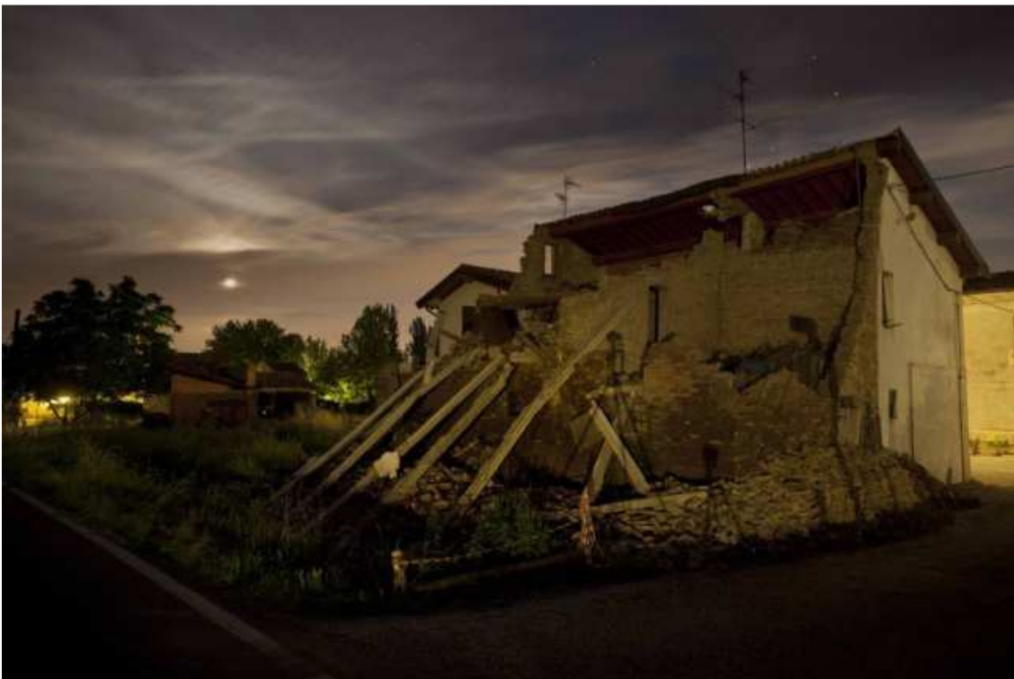
Fig. 6 – Damaged barn on a countryroad.