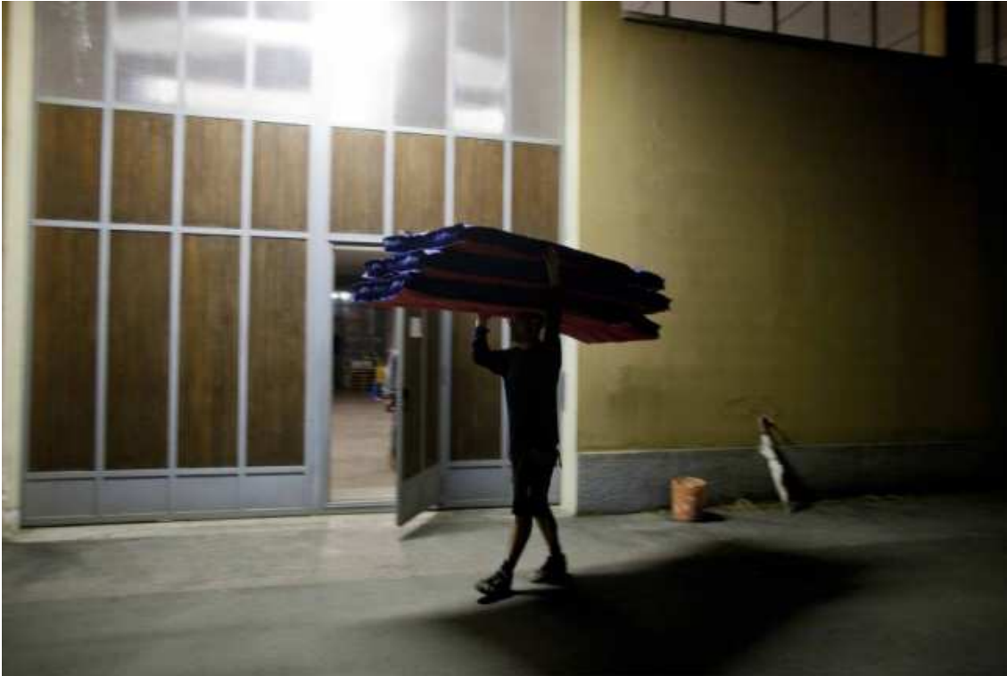
Fig. 14 – Moving forward.

Just like damaged buildings, the risk of “doing nothing” is to break such a complex aggregation of relationship, causing the abandon of little towns and of their surrounding territories, losing all the elements of this Heritage, from the tangible to the intangible