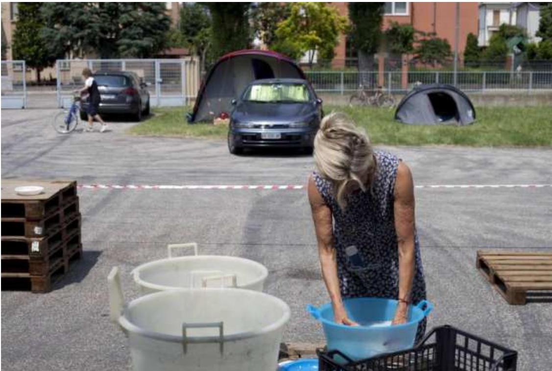
Fig. 13 – Washing dishes after lunch.