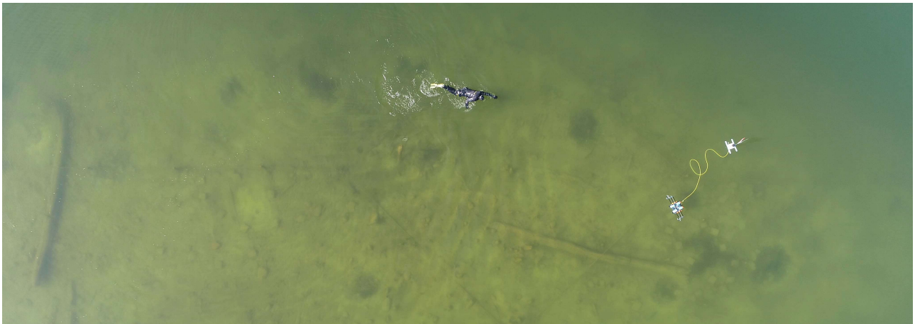
Fig. 1. The diving robot "Manio" documents semi-autonomously a pile dwelling settlement. Since the system has not yet reached market maturity, it is supported by a snorkeler who can intervene if necessary.

This poster presents a robust wireless solution that can reliably transmit both control and video signals. A radio buoy was developed for the BlueROV 2, which has already been used successfully in various documentation campaigns. The buoy was extended by a sonar and will serve as a further sensor for localization in the future. At Lake Keutschacher See in Austria, the system was successfully used with a radio range of up to 500 metres (see Fig. 1).