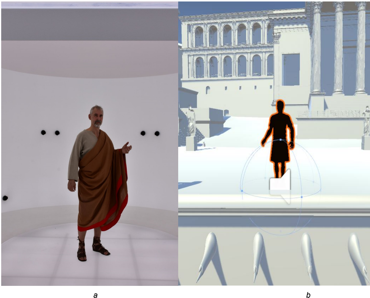
Fig. 3. a) Volumetric Video Shot. b) Cicero Speech

further investigate certain interests later on or share them with other viewers. Users can also play little versions of ancient games and riddles, like the Roman Rota game, on some special positions on the Forum.